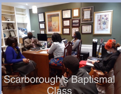
Scarborough's Baptismal Class