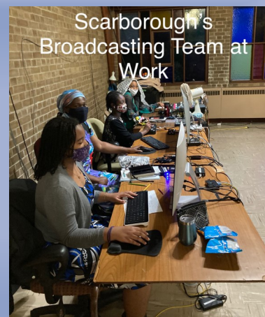
Scarborough's Broadcasting Team at Work