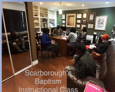
Scarborough's Baptism Instructional Class