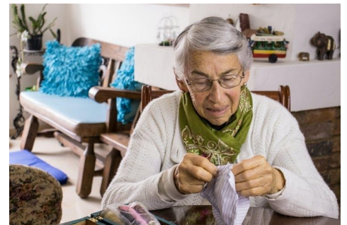
An older woman sews a face mask.