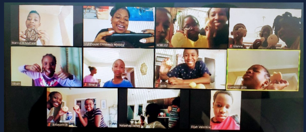
Aug 2020: Baking cookies.